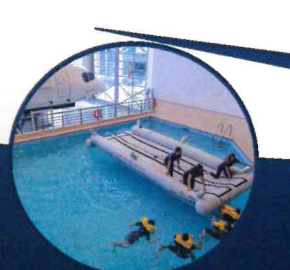
A321 NEO Cabin Emergency Evacuation Trainer