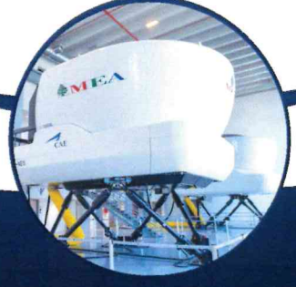
Airbus A320 Full Flight Simulators