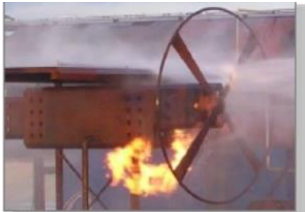
Turboprop engine fire