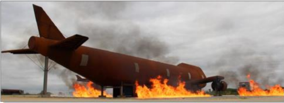
Fuel spire fire