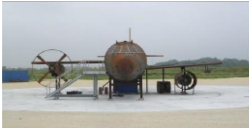
ATR / A320 fire mock-up