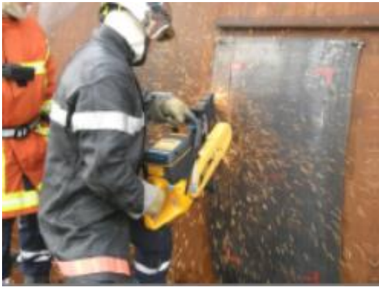
Fuselage cutting in