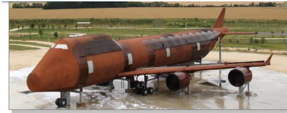
B747 / A330 mock-up