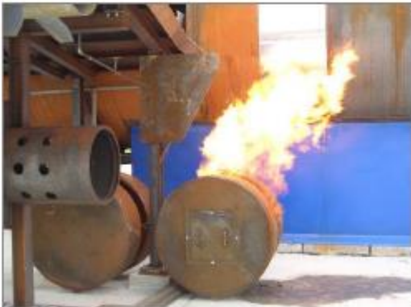
Landing gear fire